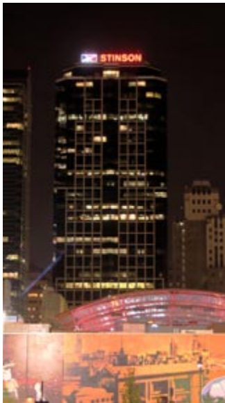
The Stinson Morrison Hecker sign lights up the Kansas City sky. The Kansas City Live area of the Power & Light District in the foreground.

We are still flying high after our dramatic installation of the Stinson Morrison Hecker sign in downtown Kansas City, Missouri. The 10' x 80' sign was installed in three sections, 30 stories above the street, by helicopter. Many months of planning went into the design and coordination of the sign. We contracted Midwest Helicopters out of Willowbrook, IL to assist us with the install. Their experience in this type of lift made it look like we do this type of thing every week!