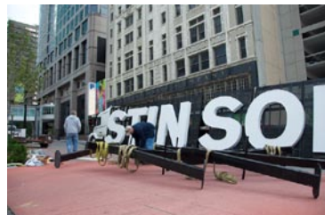
Preparing for the install.

You can see a complete video of the installation along with interviews with key personnel from Stinson and Star Signs.