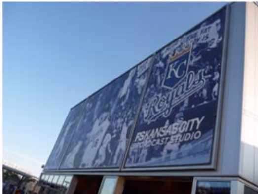
Two samples of large scale digital printing in action at Kauffman Stadium, home of the Kansas City Royals Baseball Club.

Large format digital printing seems to be everywhere you look. It's an economical solution to add color and brand identity to new spaces or update existing spaces. Star Signs has learned through hands-on experience that it requires attention to detail and good communication with the client to achieve the perfect final product.