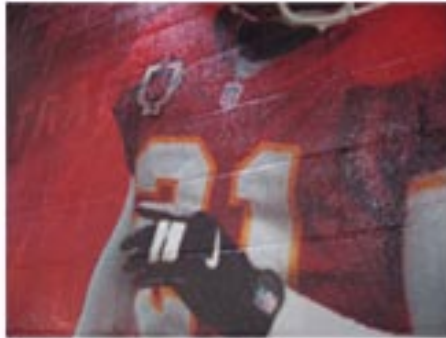
Now large scale printing can be done on any texture or surface like here on the walls of Arrowhead Stadium.

Textured surfaces have never been an option for graphic film applications...until now! 3M's Graphic Film for Textured Surfaces IJ8624 offers great print quality and superior conformability to textured surfaces that can expand your branding and identity into brand new territories!